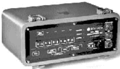
Optional DS 7000 Deck Unit